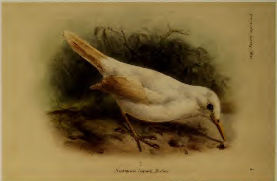
Figure 1. The first published illustration of Necropsar leguati , from Forbes (1898)

This single specimen became the focus of one unfounded assumption after another, compounded by some over-vigorous imaginations and lack of any careful subsequent scientific scrutiny, which led to the development of what in hindsight can only be regarded as a myth. With the true identity of this specimen now at hand, its entire written history can be summed up as a banquet of codswallop.